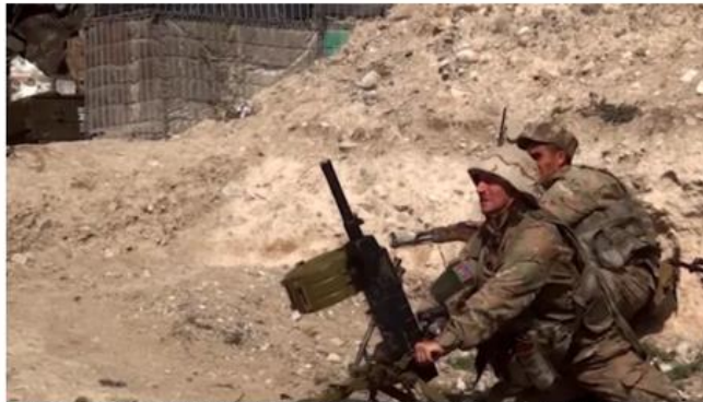
▲ An Azerbaijani army serviceman during a military operation on 28 September at the contact line of the self-proclaimed Nagorno-Karabakh Republic.

Fighting between Armenia and Azerbaijan threatened to escalate as both sides accused each other of targeting border areas outside Nagorno-Karabakh and Armenian officials claimed Turkey was deploying fighter jets in the conflict.